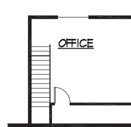
MEZZ. FLOOR PLAN

SPENCER MEAD 206.787.1476 smead@neilwalter.com