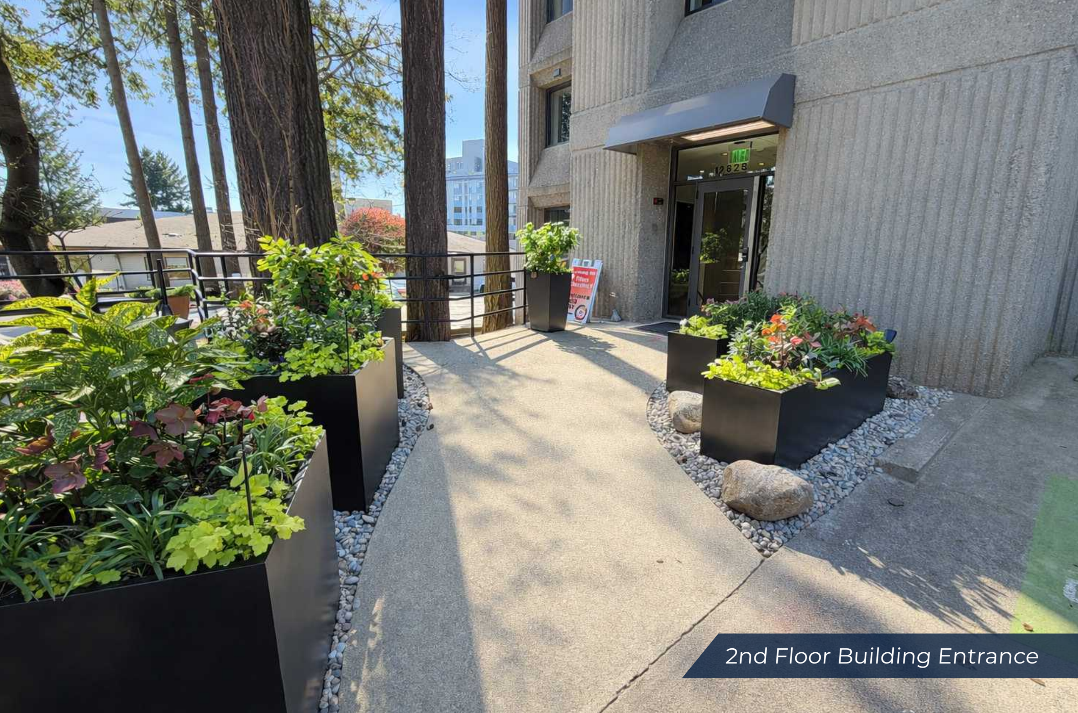
2nd Floor Building Entrance