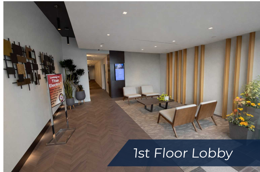
1st Floor Lobby

Base Rent $2,282.00/mo NNN Rent $903.29/mo Available July 1, 2026