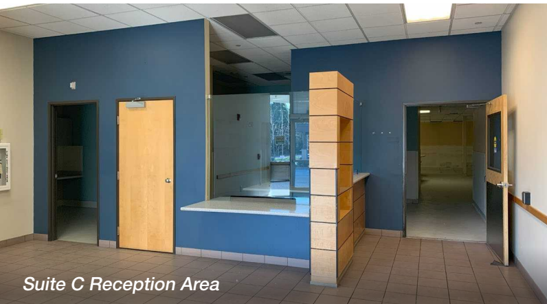
Suite C Reception Area