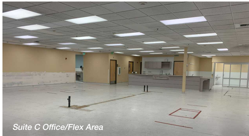
Suite C Office/Flex Area