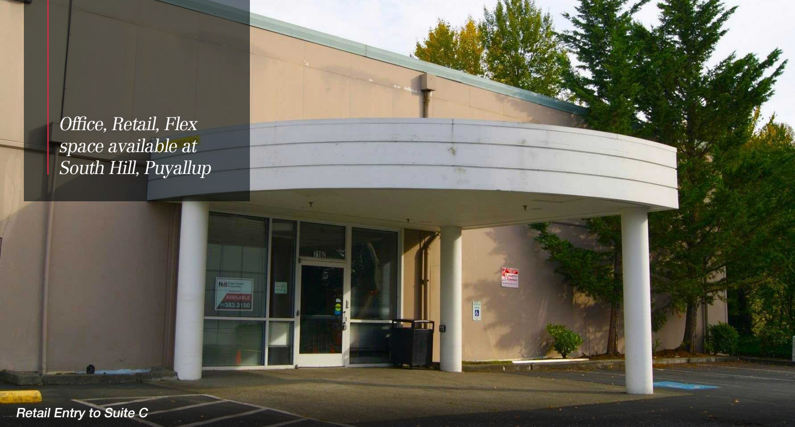
Retail Entry to Suite C

Office, Retail, Flex space available at South Hill, Puyallup