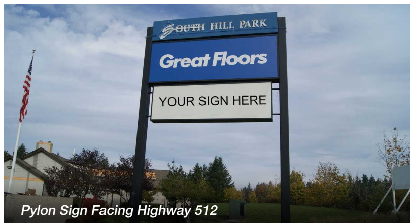
Pylon Sign Facing Highway 512

KIM MARVIK Partner +1 253 203 1325 kmarvik@nai-pp.com