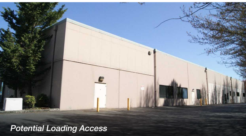
Potential Loading Access