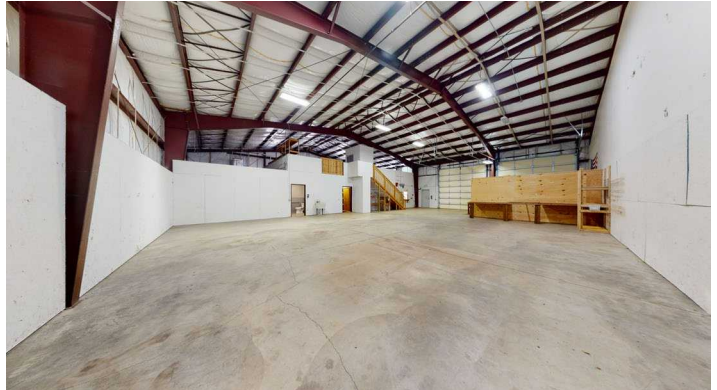
WAREHOUSE - FACING MEZZANINE