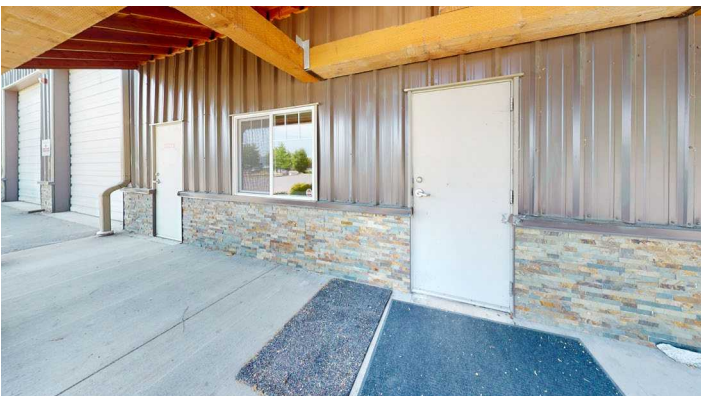
SUITE C ENTRY