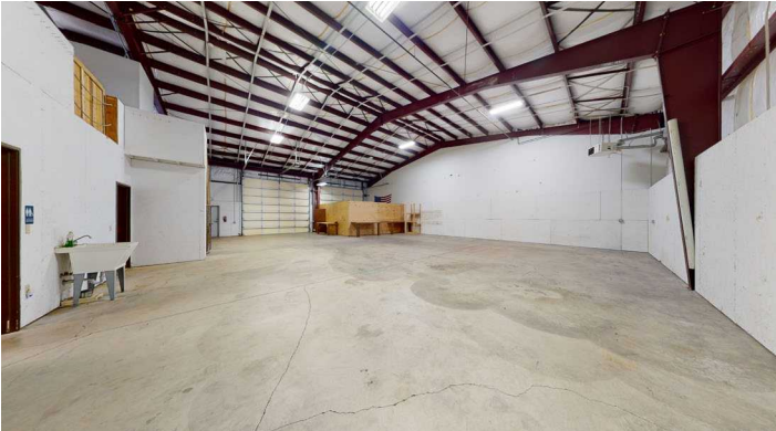
WAREHOUSE WITH TWO 14' ROLLUP DOORS