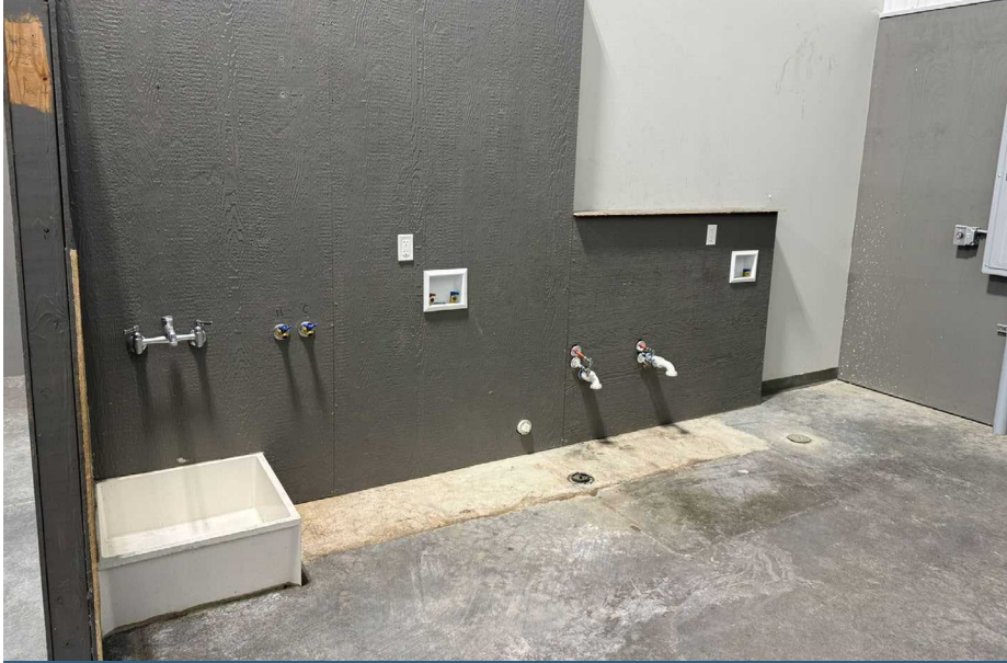
PLUMBING ROUGH ENDS FROM PREVIOUS THREE COMPARTMENT SINK

7940 29TH AVE NE, SUITE 118, LACEY, WA 98516 | HAWKS HUB (BUILDING 1)