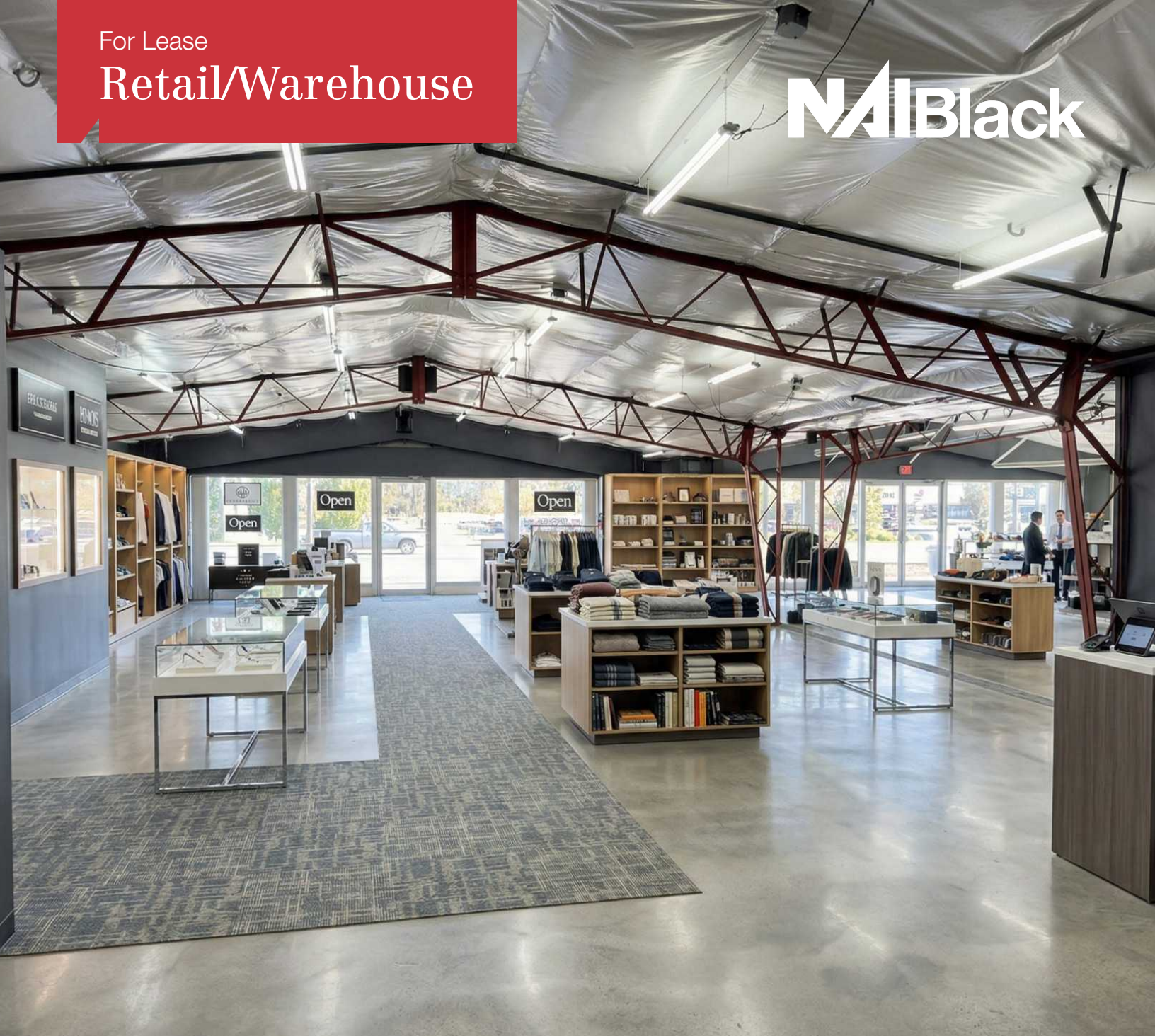
Envisioned Retail Showroom Rendering