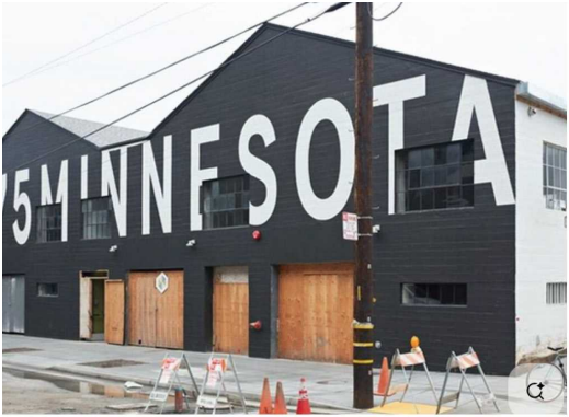
Place & Graphics