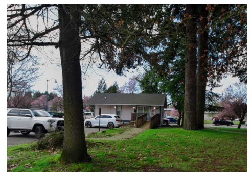
PARKING LOT ENTRANCE