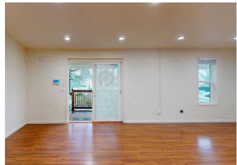
INTERIOR - EXIT TO PARKING

THIS FLOORPLAN IS NOT TO SCALE. SIZES AND DIMENSIONS ARE APPROXIMATE, ACTUAL MAY VARY.