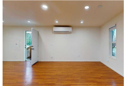
INTERIOR - EXIT TO LITTLEROCK