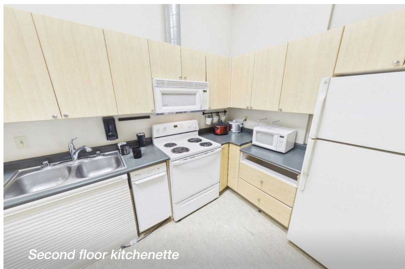
Second floor kitchenette