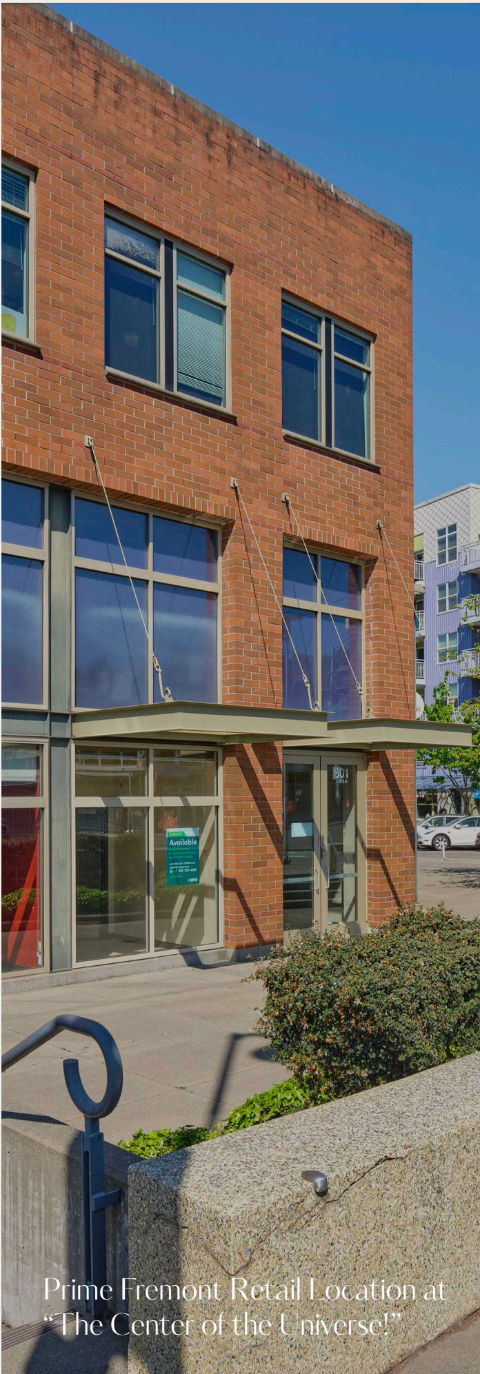
Prime Fremont Retail Location at “The Center of the Universe!”