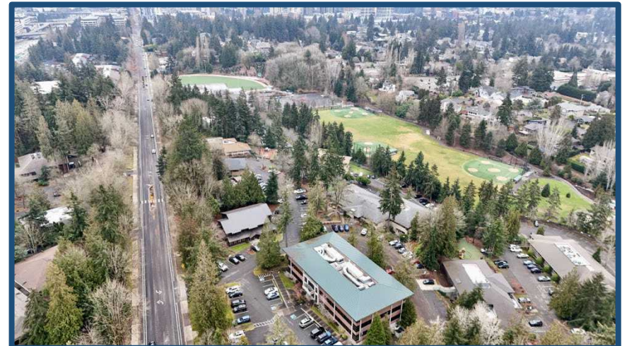
Hidden Valley Park