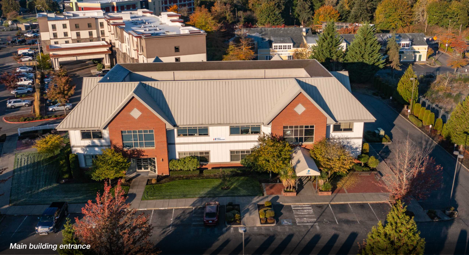
Main building entrance