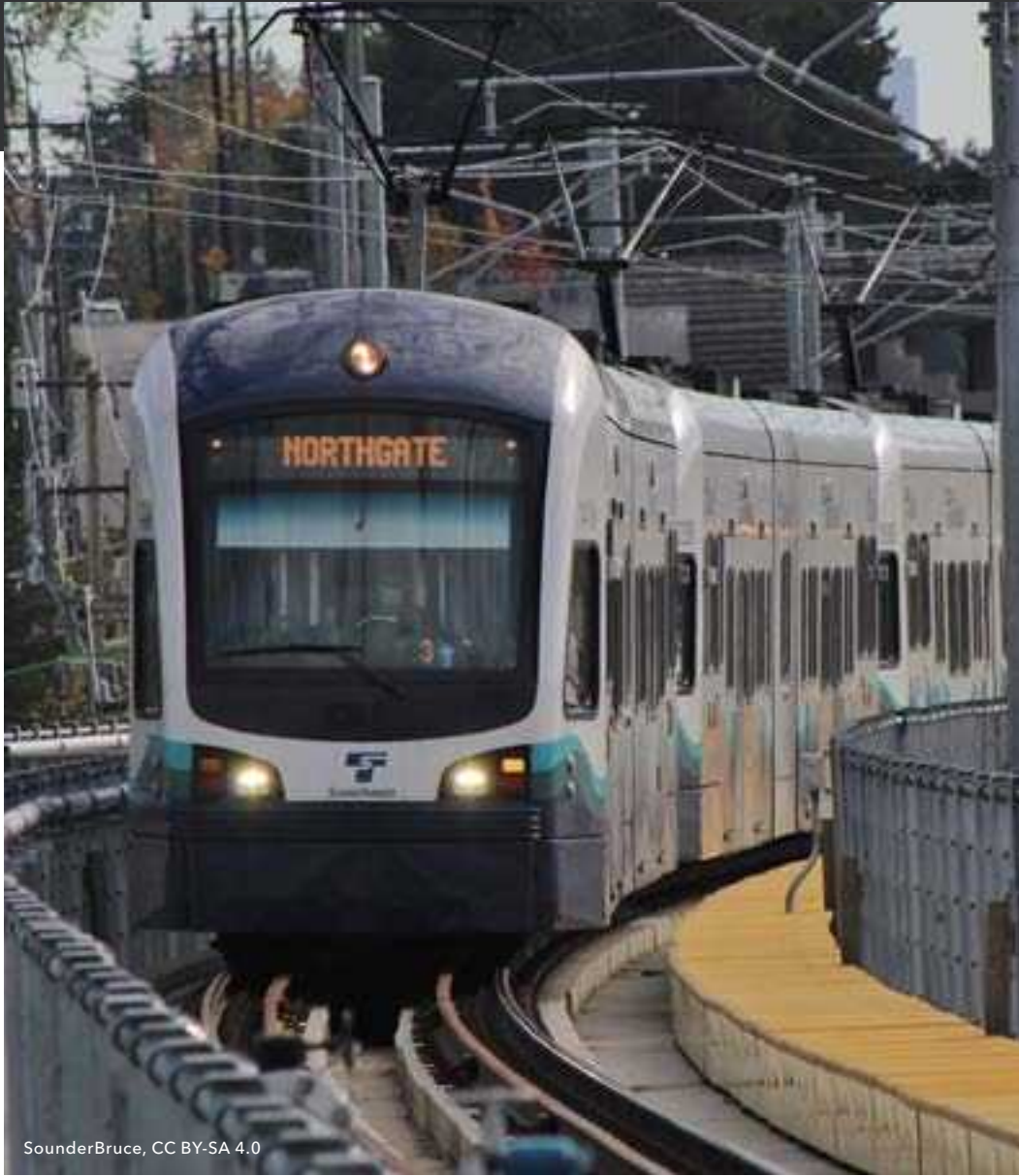
SounderBruce, CC BY-SA 4.0