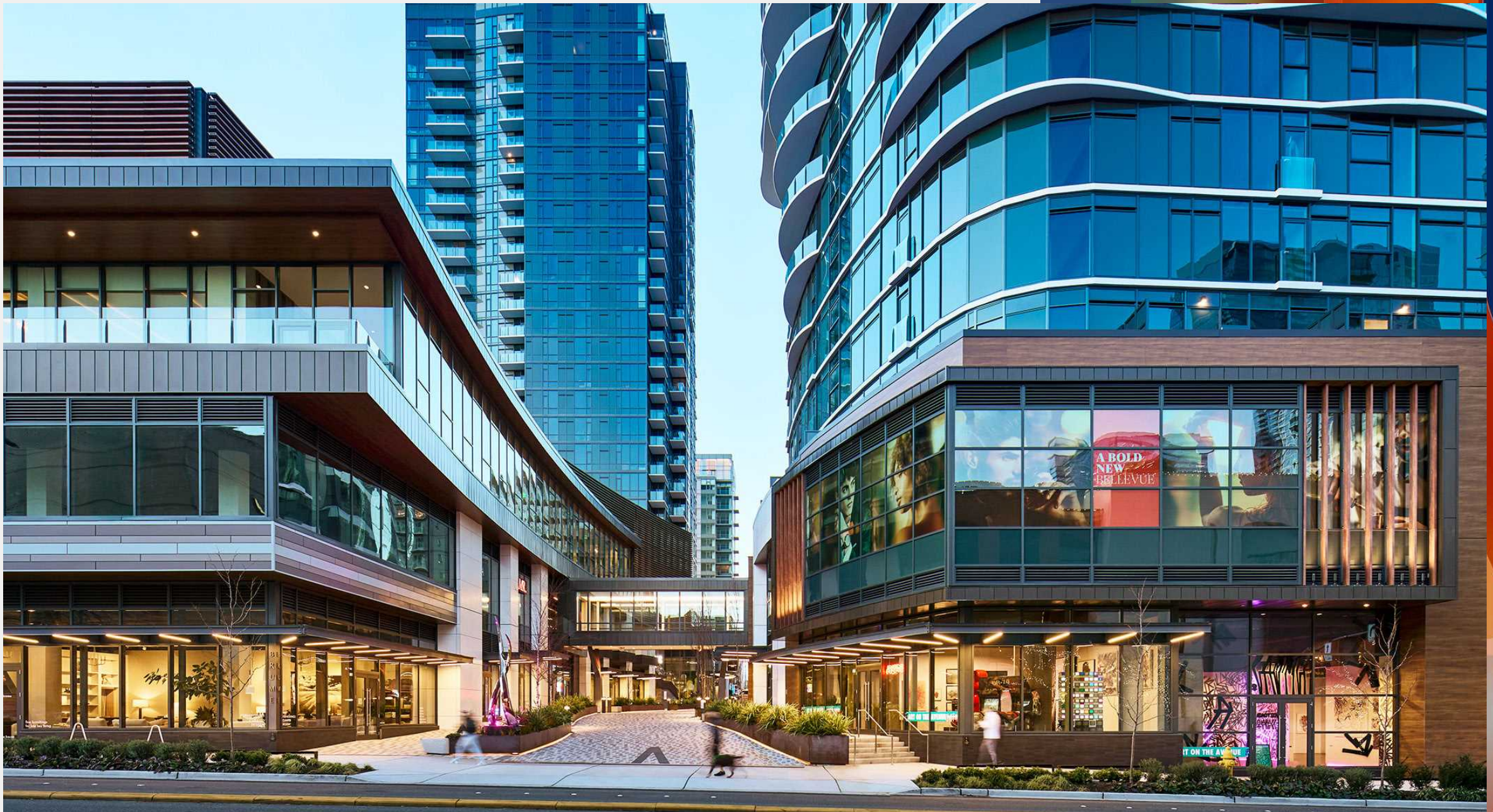
Avenue Bellevue DOWNTOWN BELLEVUE