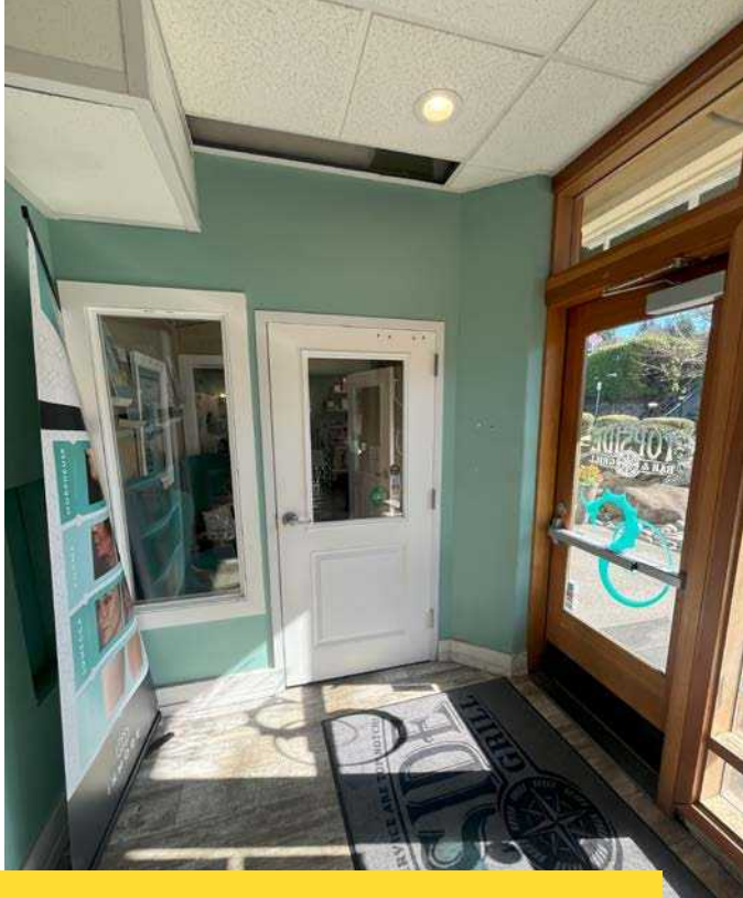
ENTRANCE OFF RAINIER STREET