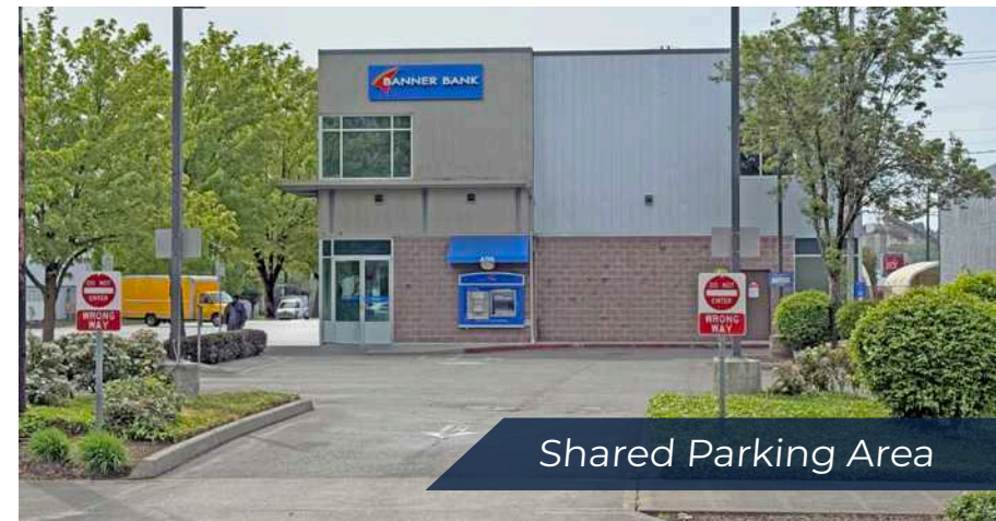
Shared Parking Area