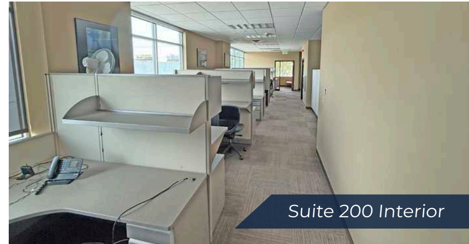
Suite 200 Interior