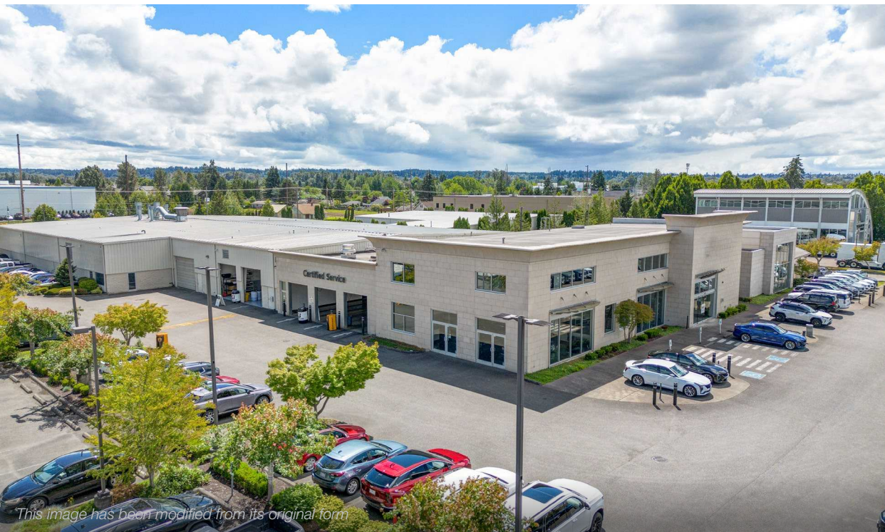
This image has been modified from its original form