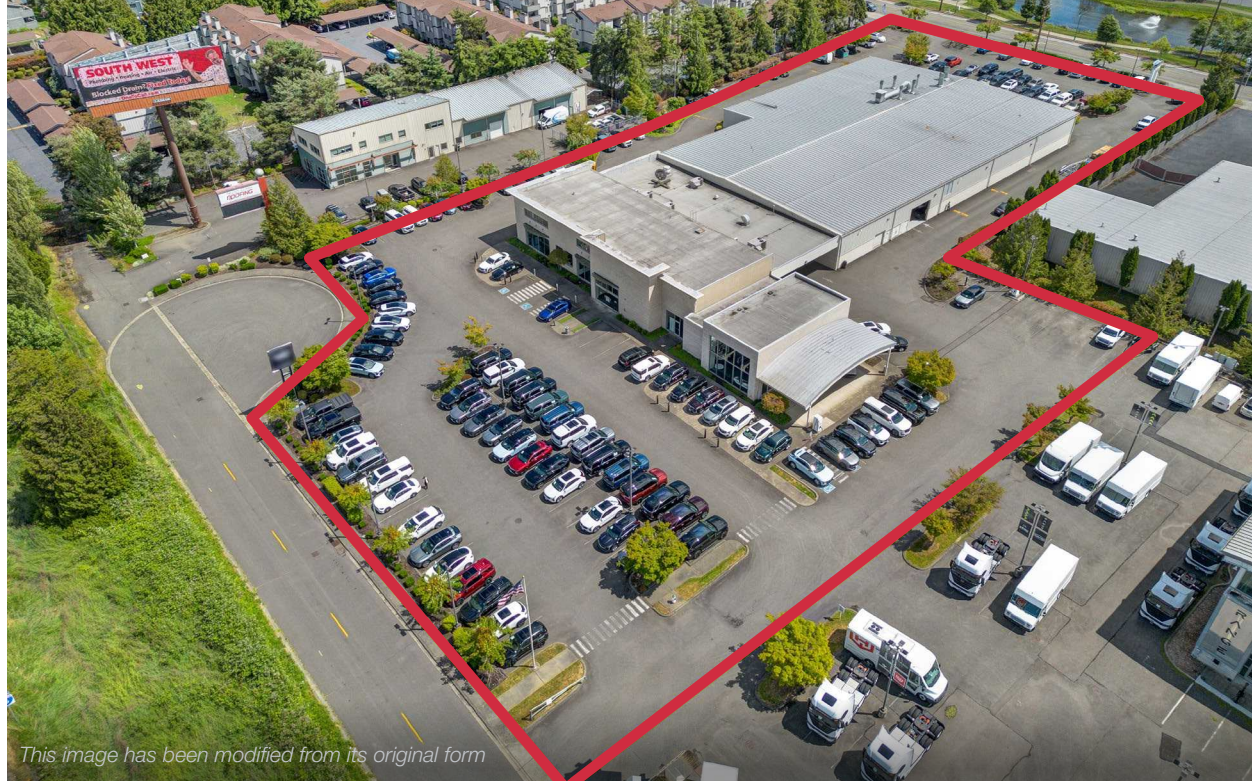
This image has been modified from its original form