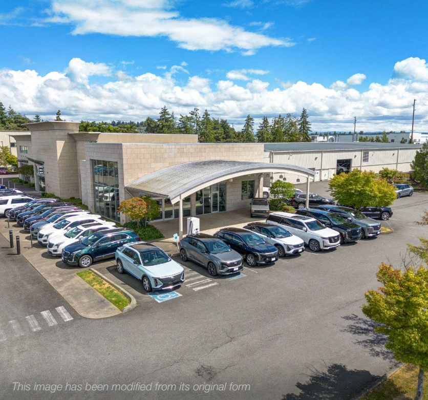
This image has been modified from its original form