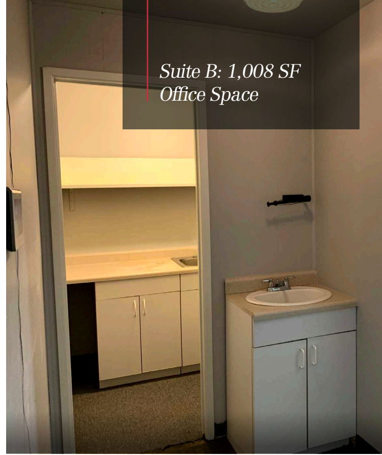
Suite B: 1,008 SF Office Space