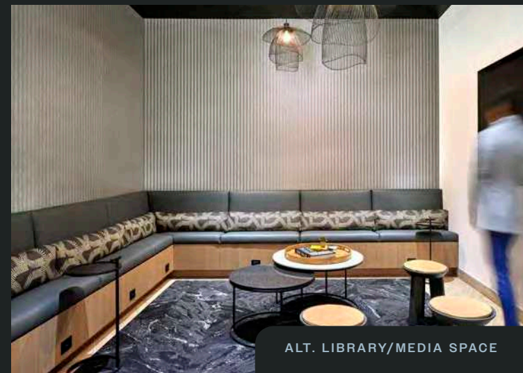
ALT. LIBRARY/MEDIA SPACE