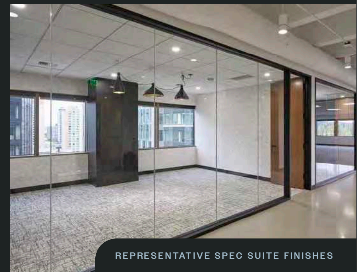
REPRESENTATIVE SPEC SUITE FINISHES