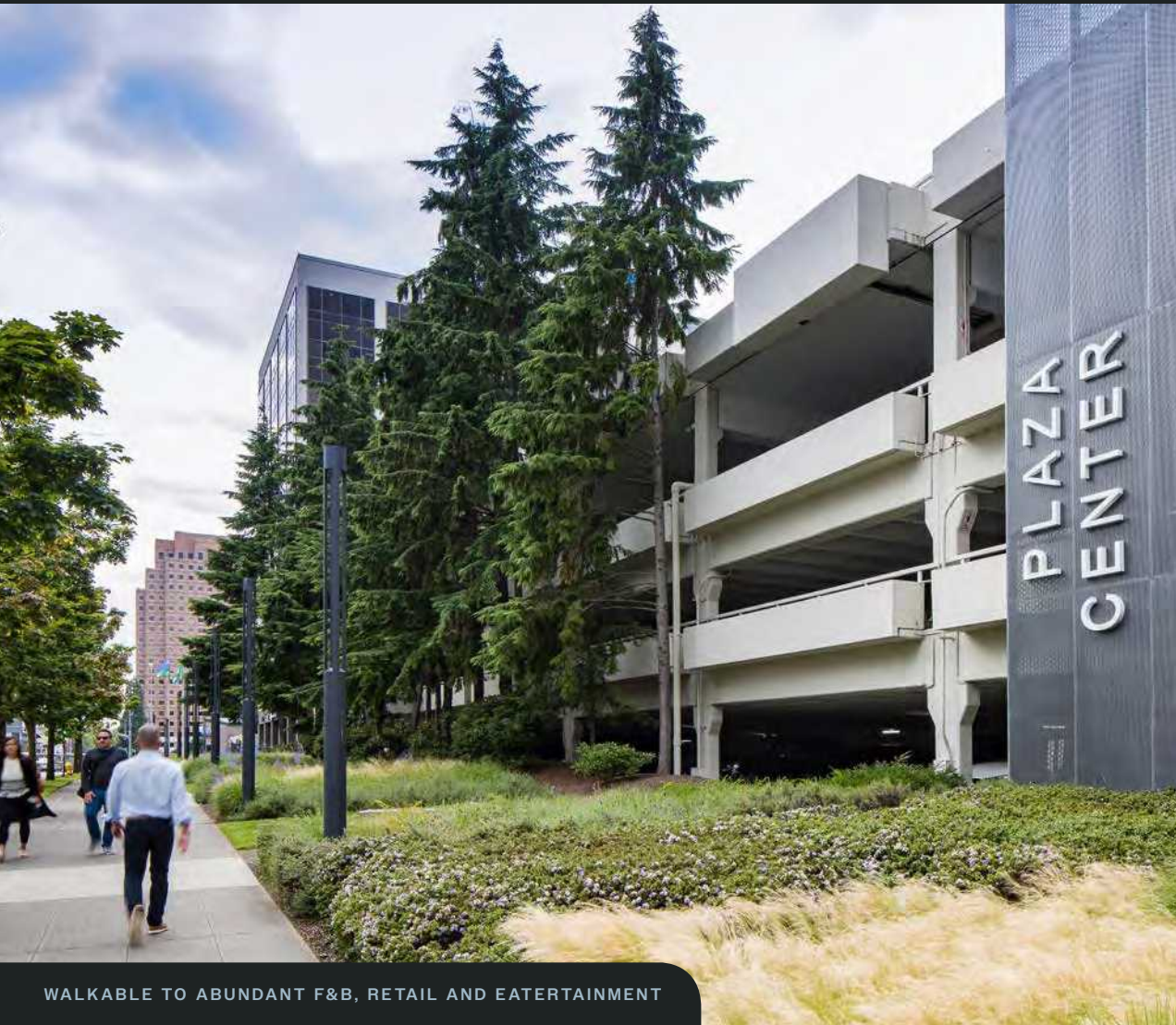
WALKABLE TO ABUNDANT F&B, RETAIL AND EATENTAINMENT

Active community events and on-site management, engineering and security