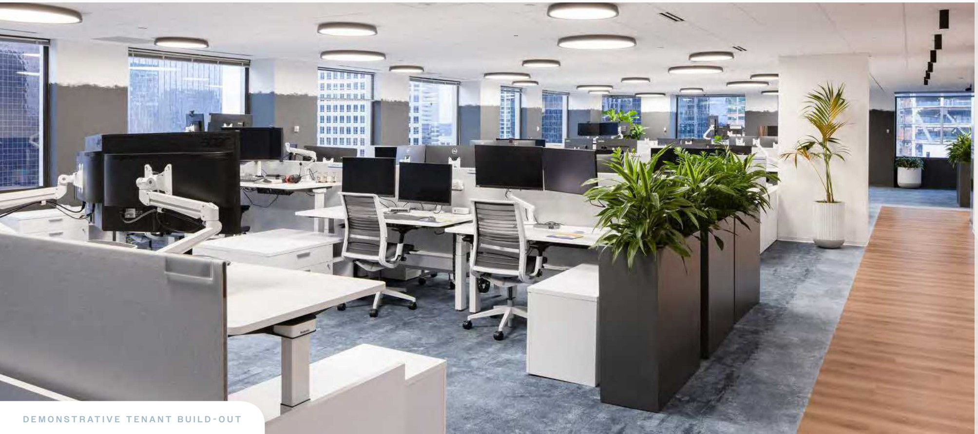
DEMONSTRATIVE TENANT BUILD-OUT