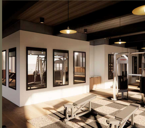
Brand New Class A Fitness Center