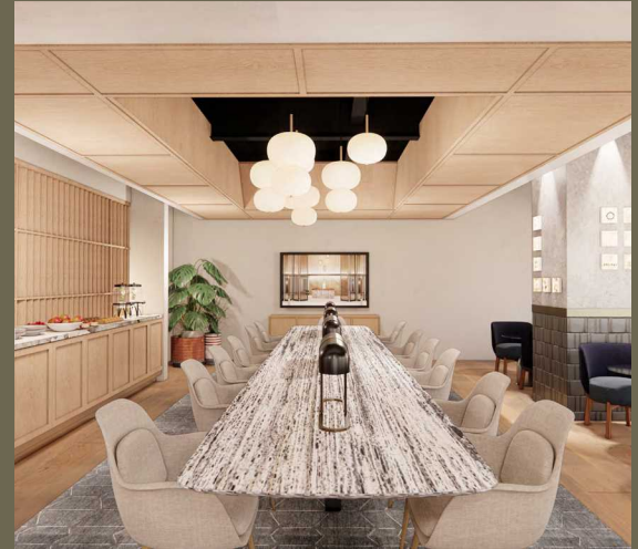
Building Conference Center