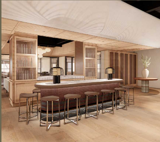
Tenant Amenity Lounge