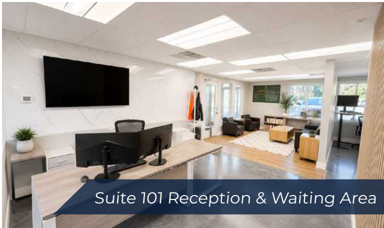
Suite 101 Reception & Waiting Area