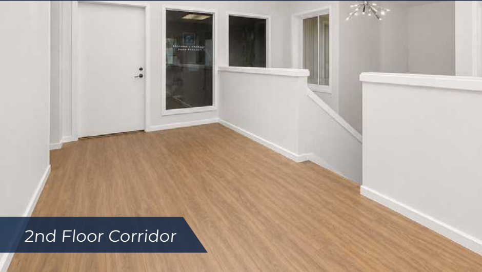
2nd Floor Corridor