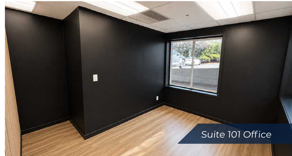
Suite 101 Office