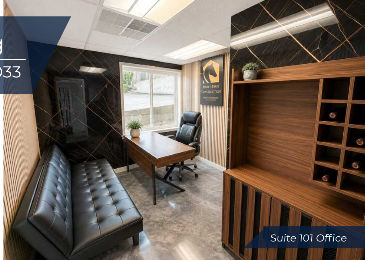
Suite 101 Office