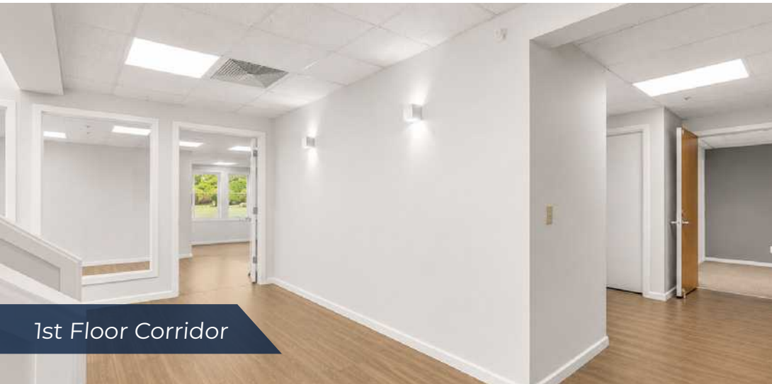
1st Floor Corridor