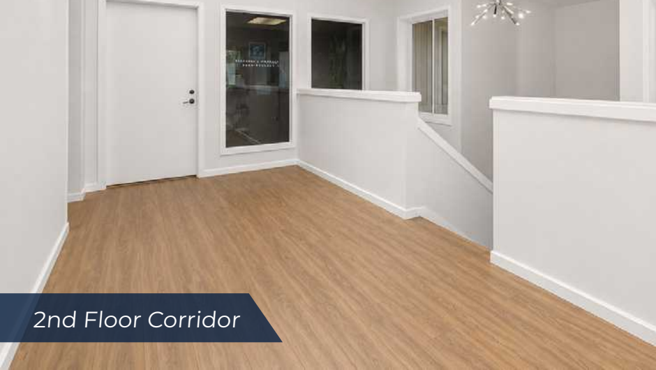
2nd Floor Corridor