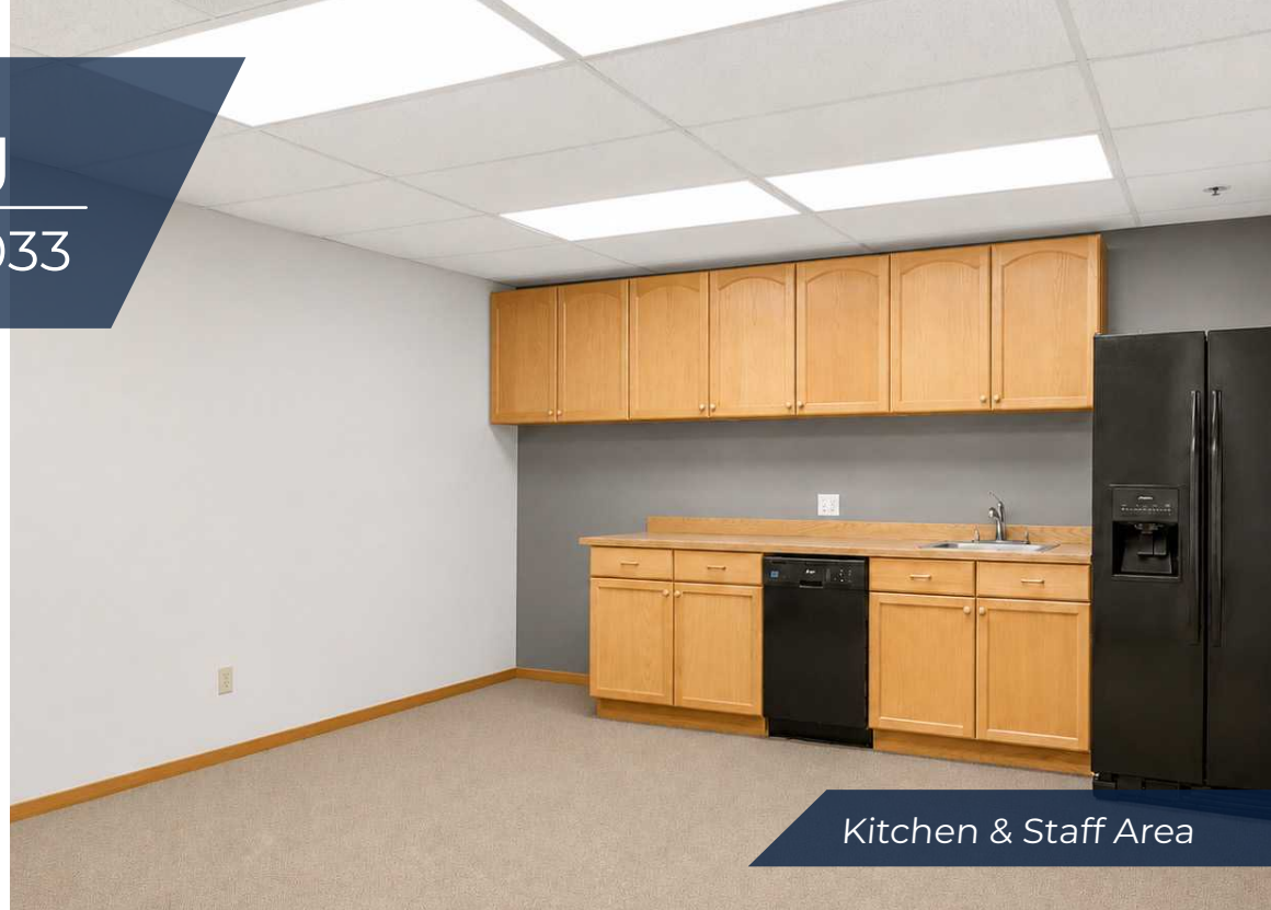
Kitchen & Staff Area