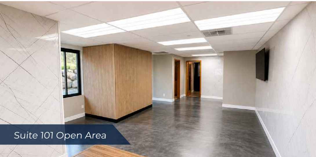
Suite 101 Open Area