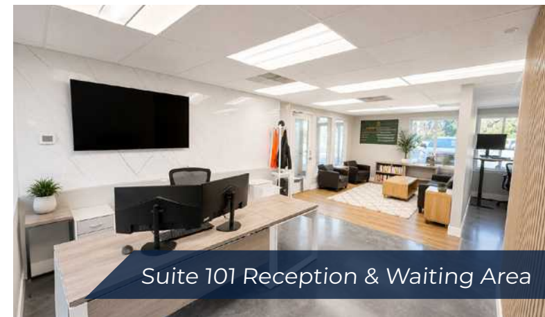
Suite 101 Reception & Waiting Area