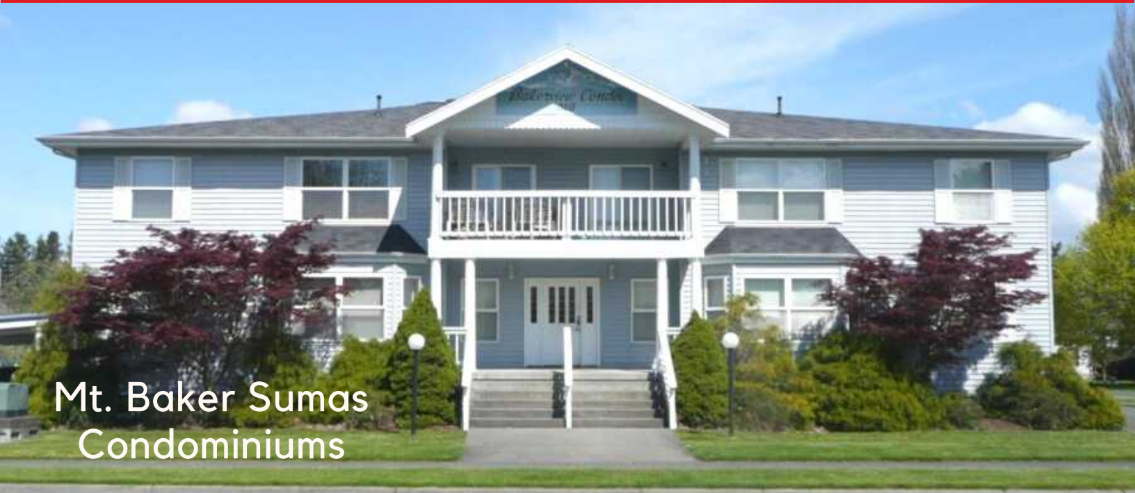
Mt. Baker Sumas Condominiums