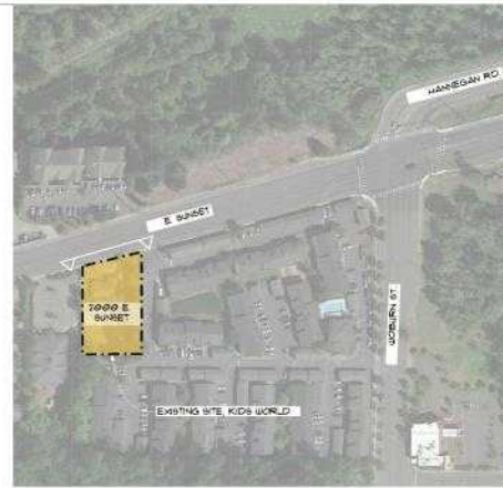
VICINITY MAP SCALE: N.T.S.