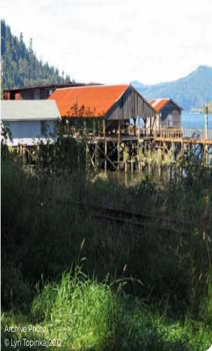
Archive Photo © Lyn Topinka, 2012

With a total of nearly 400 acres, Bradwood is a unique piece of property located just 2.4 miles from Highway 30. Of these 400 acres, 50 acres are zoned for marine industrial use and have the potential for a zoning change/expansion if desired. It is estimated that the flat waterfront land could be doubled to about 100 acres, with the remaining roughly 300 acres mostly sloped forest land. The site is served by an existing mill pond that can be filled with existing dredge sand that is already on site. This dredge sand could also be used to raise the entire 50 acres by a foot.