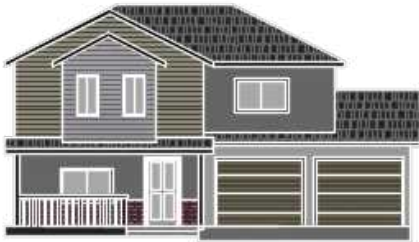
Single Family Detached