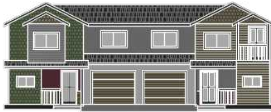
Single Family Attached (Duplex)