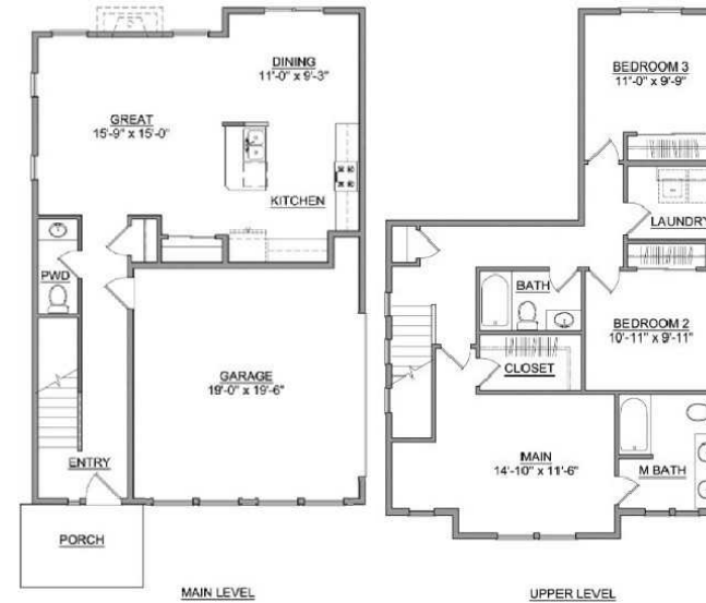
Single Family and Duplex Unit (Rear of Property Location)