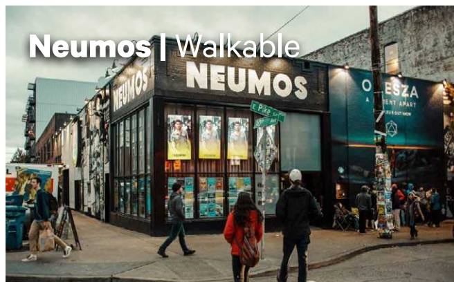
Neumos | Walkable