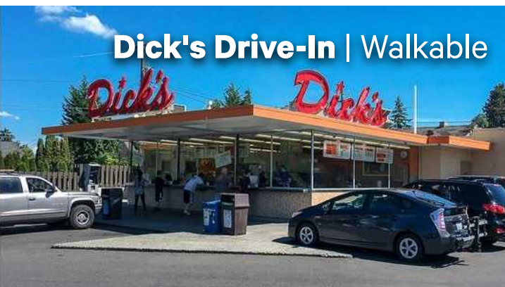
Dick's Drive-In | Walkable