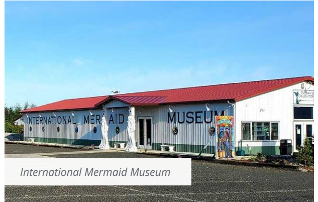
International Mermaid Museum