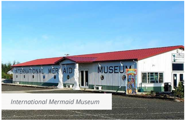
International Mermaid Museum