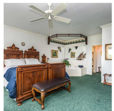
Maria Theresa's Suite