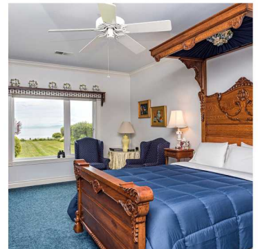
Marie Antoinette's Boudoir