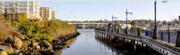
10 Mile Commute to BREMERTON