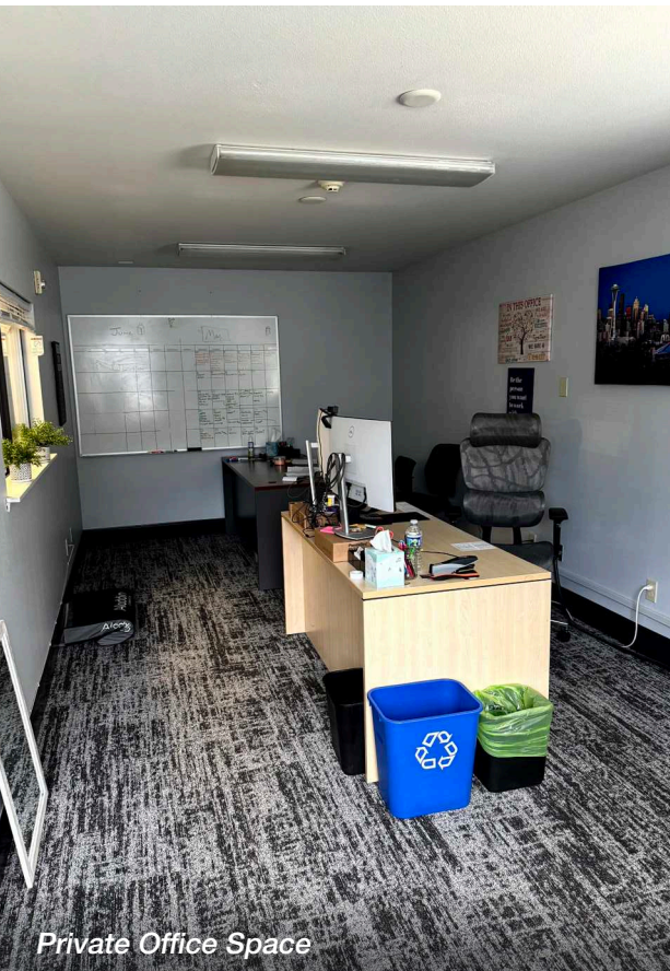
Private Office Space