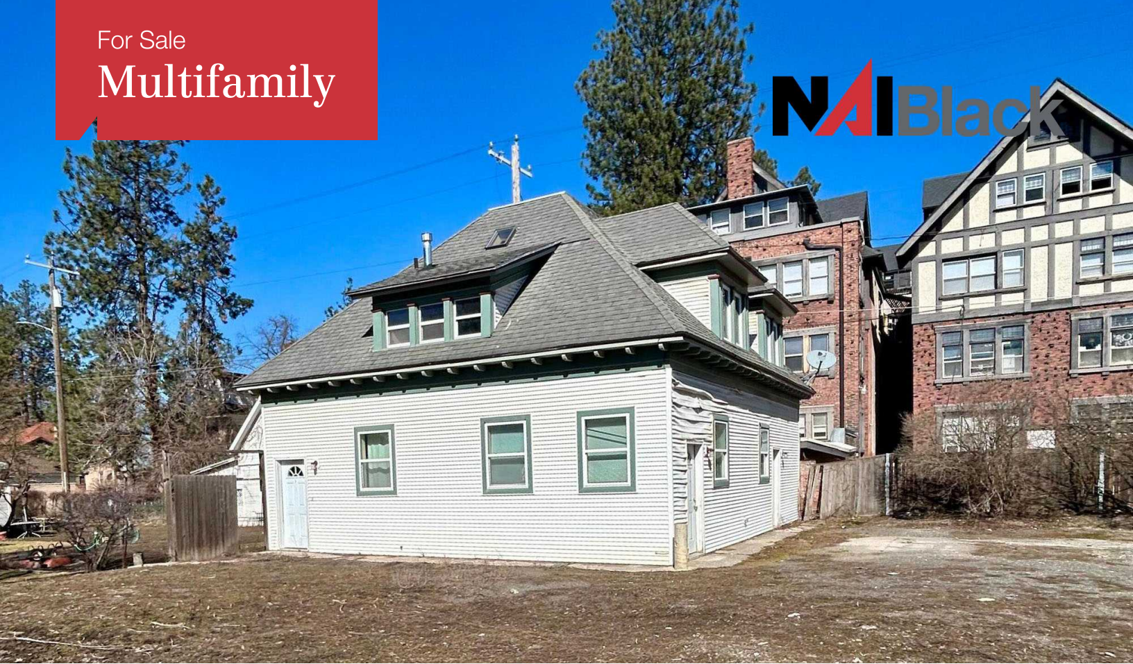
2314 West 2nd Avenue Spokane, WA 99201 07.18.22