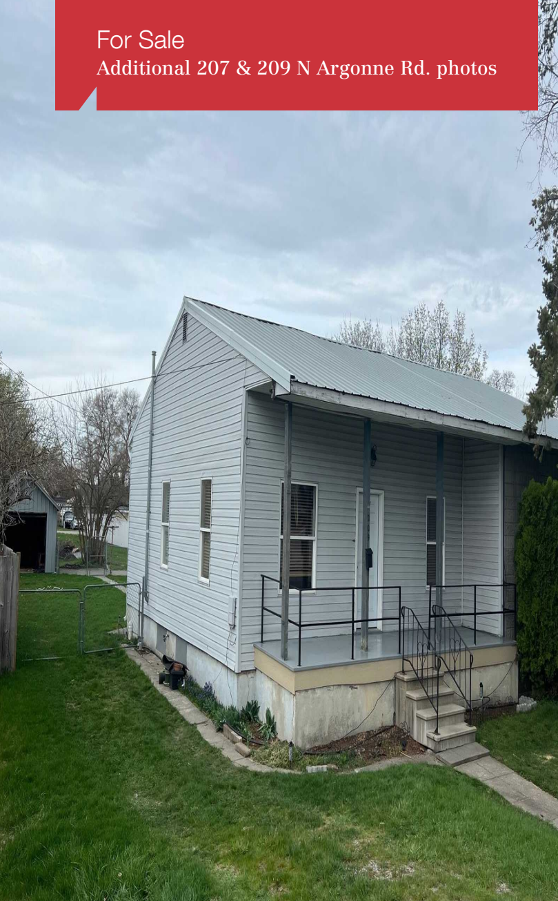
209 Front Entry

For Sale Additional 207 & 209 N Argonne Rd. photos