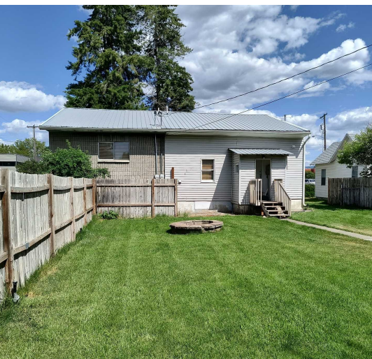
209 Rear Entry