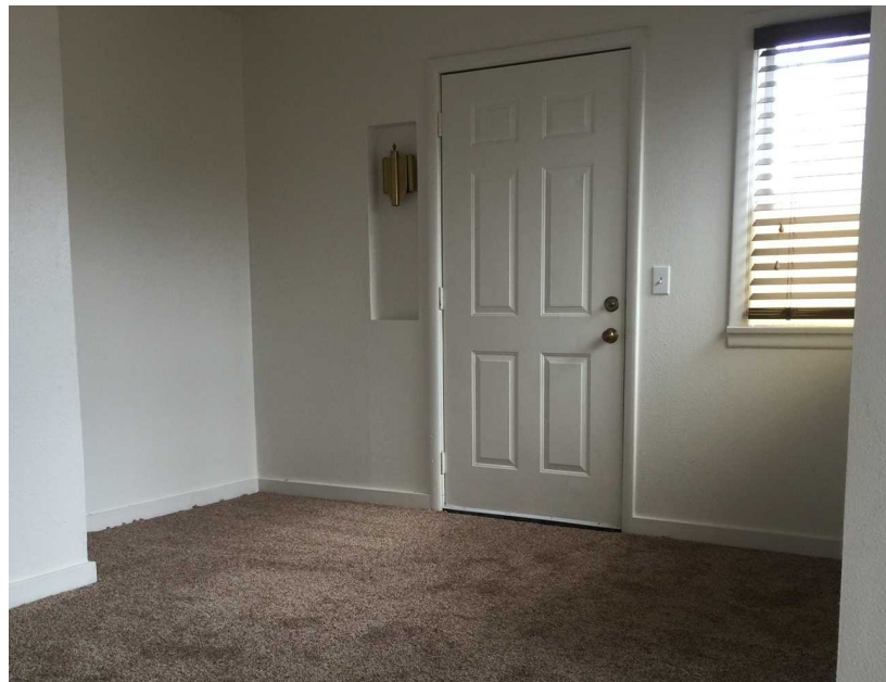
207 Entry Room