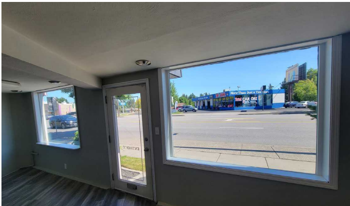
1925 W Northwest Blvd