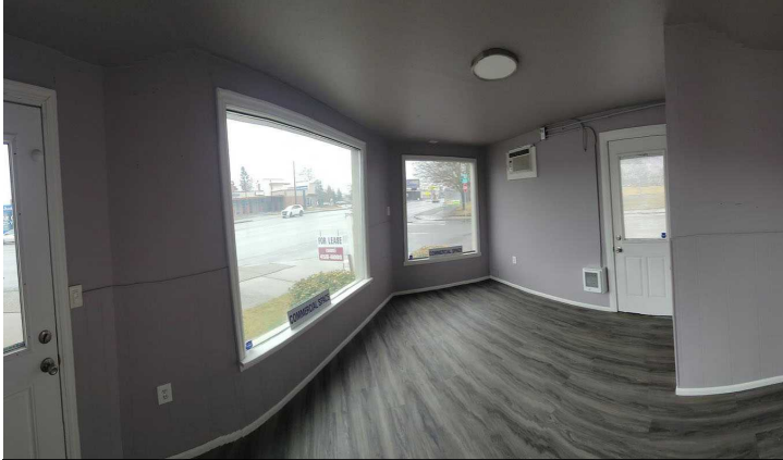
1921 W Northwest Blvd