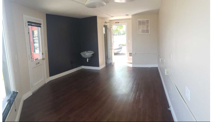
1923 W Northwest Blvd