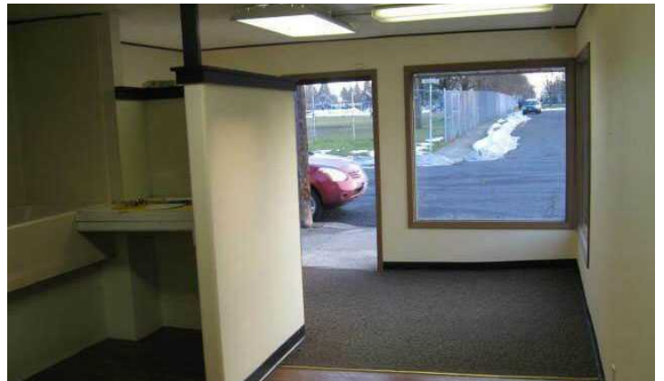
1928 W Northwest Blvd