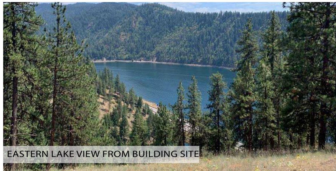
EASTERN LAKE VIEW FROM BUILDING SITE