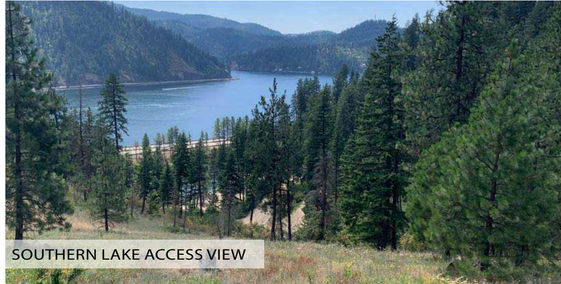
SOUTHERN LAKE ACCESS VIEW