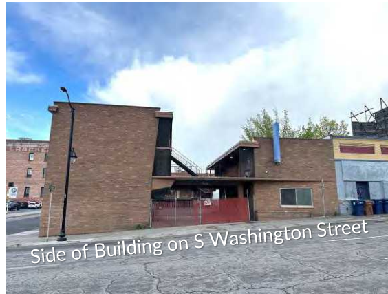
Side of Building on S Washington Street