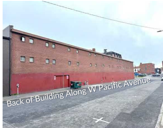
Back of Building Along W Pacific Avenue