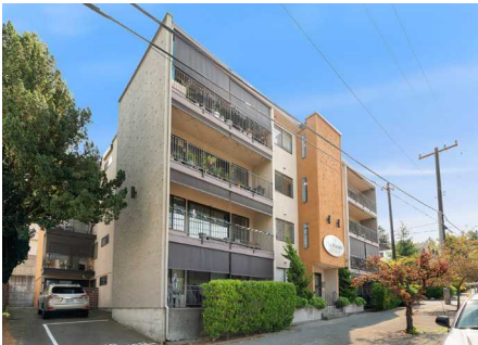
HAVEN APARTMENTS 7130 California Ave SW, Seattle, WA 98136

Price $3,300,000 Unit Count: 16 Building Size 13,120 Sq.Ft. Price Per Unit $206,250 Price/Foot $251 Market Cap Rate 7.6%