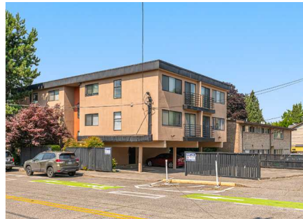
FINDLAY COURT 5454 Fauntleroy Ave SW, Seattle, WA 98136

Price $3,300,000 Unit Count: 16 Building Size 13,120 Sq.Ft. Price Per Unit $206,250 Price/Foot $251 Market Cap Rate 7.6%