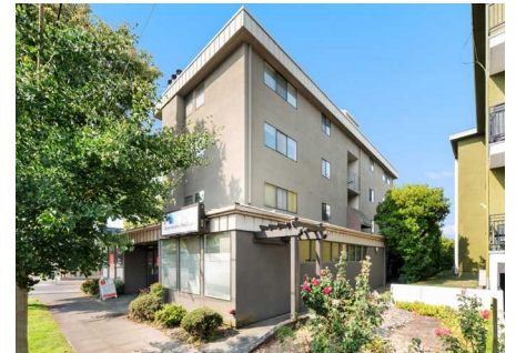
HOLLY COURT 6553 California Ave SW, Seattle, WA 98136

Price: $2,100,000 Unit Count: 10 Building Size 6,110 Sq.Ft. Price Per Unit $210,000 Price/Foot $344 Market Cap Rate 6.5%