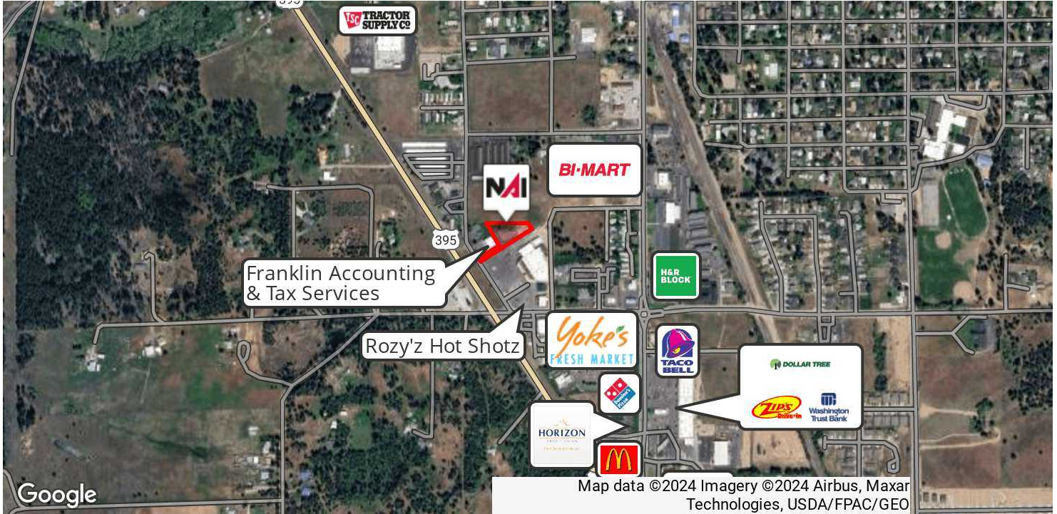
Map data ©2024 Imagery ©2024 Airbus, Maxar Technologies, USDA/FPAC/GEO