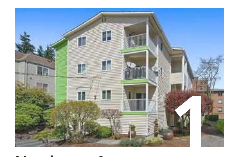
Northgate 9 1824 N 103rd St, Seattle, WA 98133