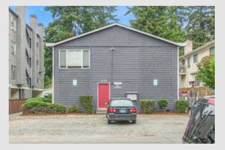
Brighton Townhomes 1220 N 137th St, Seattle, WA