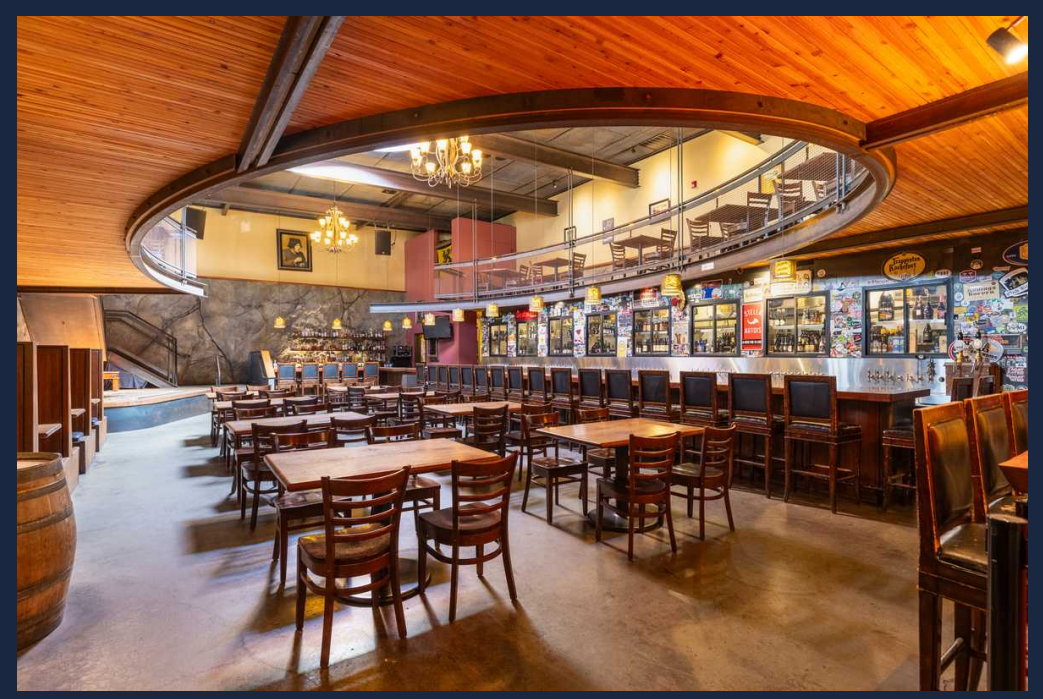
One-Of-A-Kind Must See Live/Work Building

Rare opportunity to acquire a standalone property in the heart of Fremont! Complete studs-out remodel in 2003. One must see to believe the attention to detail throughout -- this property doesn't disappoint. Incredible location just a stones throw to the Burke Gilman Trail and everything that Fremont has to offer. Located on the corner of Phinney Ave N & N. 35th St, the property has excellent visibility and signage opportunities. FF&E not included in the sale. Property will be delivered vacant at Closing.