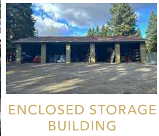
ENCLOSED STORAGE BUILDING