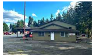
SHOP & OFFICE BUILDING