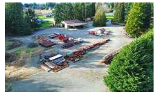
FENCED CONTRACTOR YARD