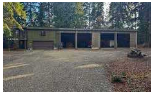
OPEN VEHICLE STORAGE BUILDING