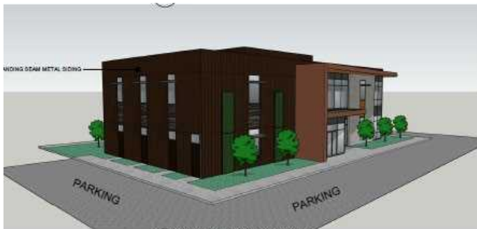
5 SOUTHWEST PERSPECTIVE N75