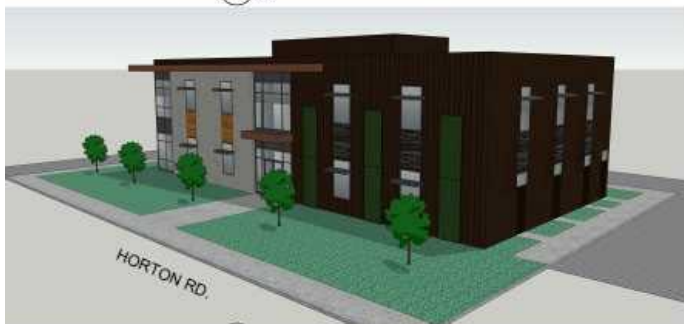
6 NORTHWEST PERSPECTIVE N75