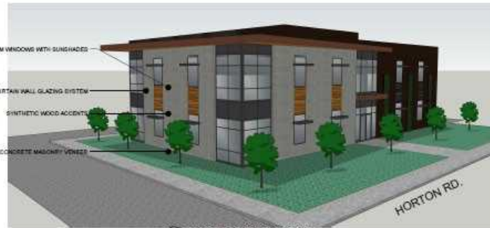
3 NORTHEAST PERSPECTIVE N75