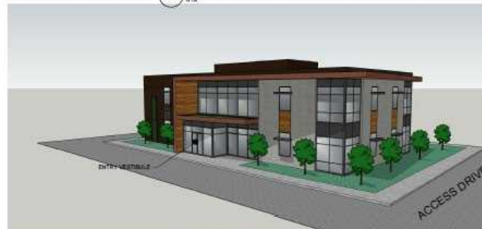
4 SOUTHEAST PERSPECTIVE N75