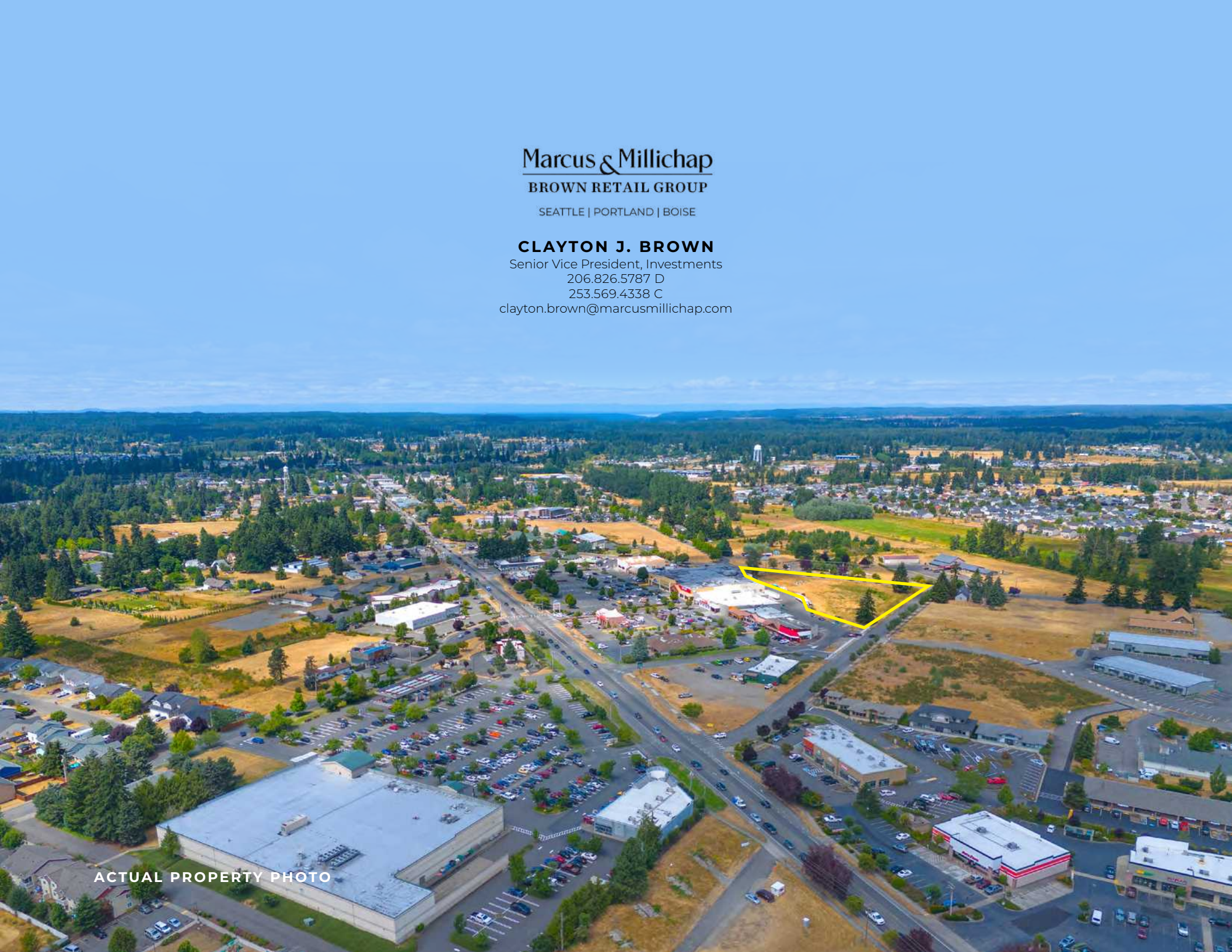
ACTUAL PROPERTY PHOTO