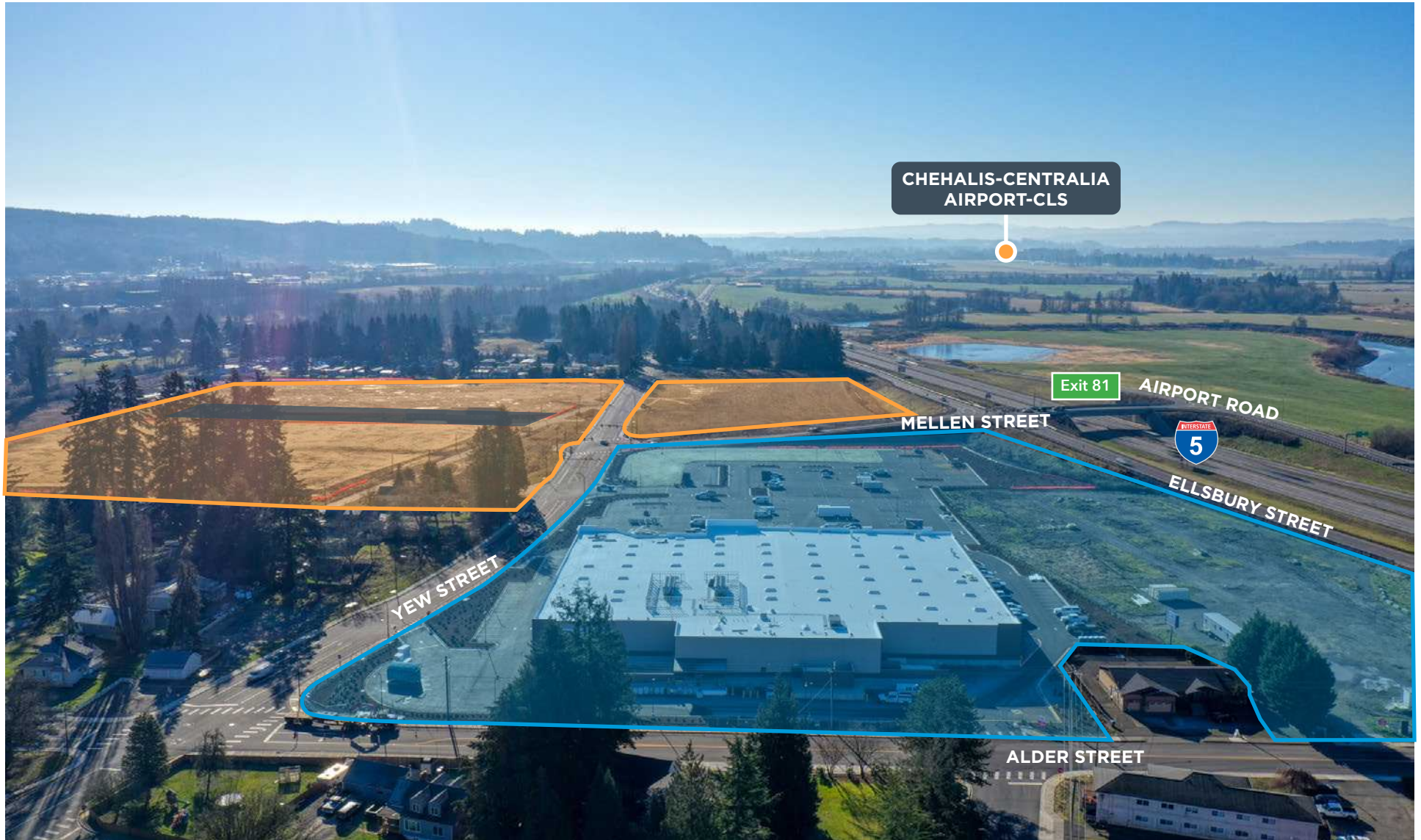
CENTRALIA STATION | PROJECT VIEW