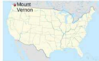
Location of Mount Vernon in the United States