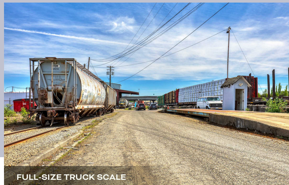
FULL-SIZE TRUCK SCALE