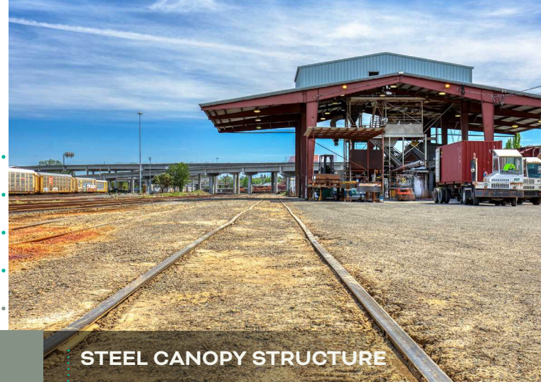
STEEL CANOPY STRUCTURE