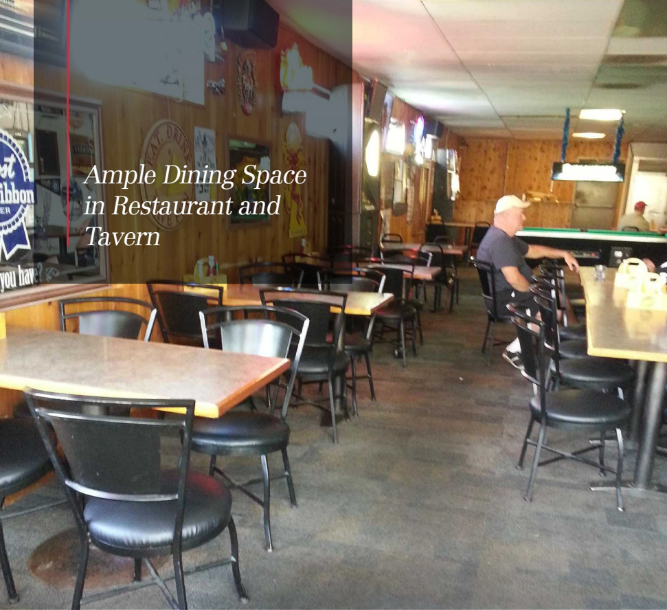
Ample Dining Space in Restaurant and Tavern